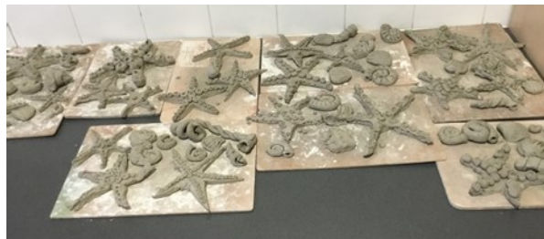
Year 6 clay work